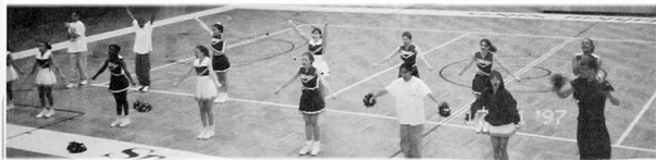
"Like, everyone who knows how to do this dance, could you, like, come and help us?"